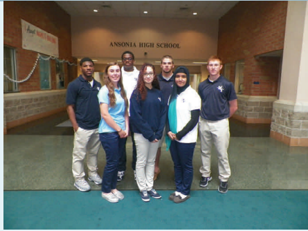
AHS students modeling Uniform Dress Code